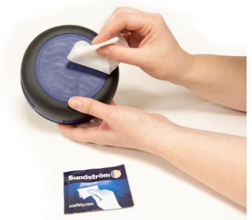
10.4 Clean the pre-filter holders inside and out.