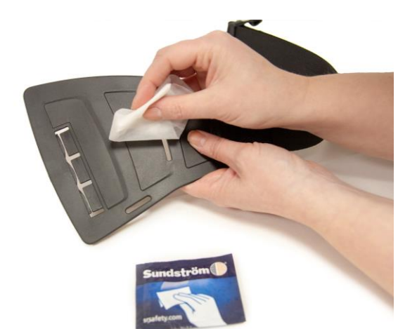
10.6 Wipe the belt clean.

Check that the sealing ridge for the particle filter is undamaged.