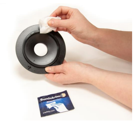
10.5 Wipe the filter adapter clean.

Check that the sealing ridge for the particle filter is undamaged.